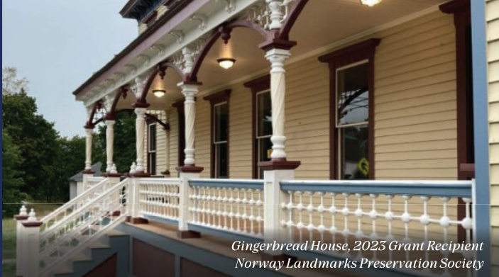
Gingerbread House, 2023 Grant Recipient Norway Landmarks Preservation Society

Tides Institute & Museum of Art, Eastport