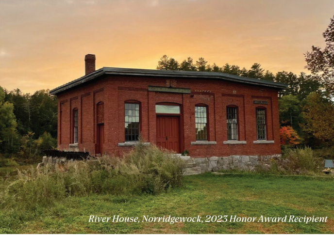
River House, Norridgewock, 2023 Honor Award Recipient