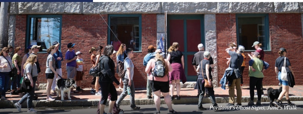
Portland's Ghost Signs, Jane's Walk

In 2023, we had the privilege of hosting three young preservationists as part of our Patricia Anderson Summer Fellows Program . All pursued our nine-week offering, which starts with four weeks of non-profit advocacy and programming work with Maine Preservation staff and then transitions to five weeks of