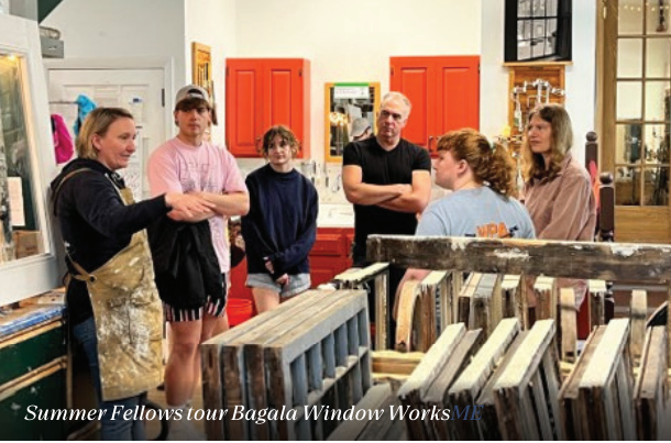
Summer Fellows tour Bagala Window Works ME

hands-on, immersive training with a Maine-based trades firm.